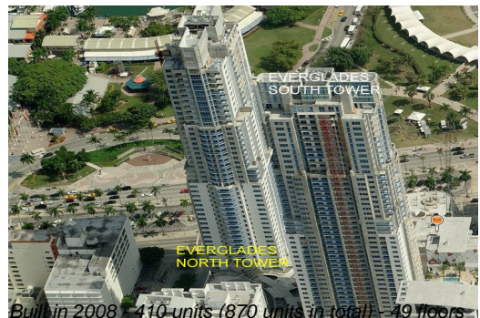
Built in 2008 - 410 units (870 units in total) - 49 floors