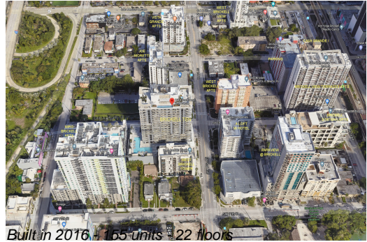
Built in 2016 - 165 units - 22 floors