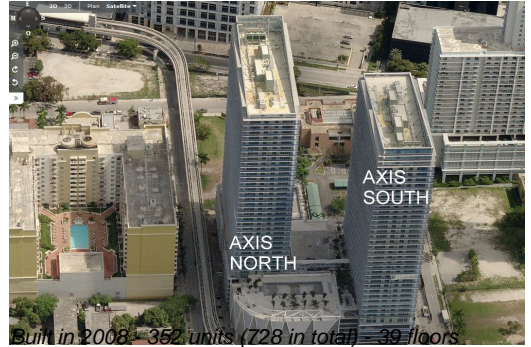
Built in 2008 - 352 units (728 in total) - 39 floors