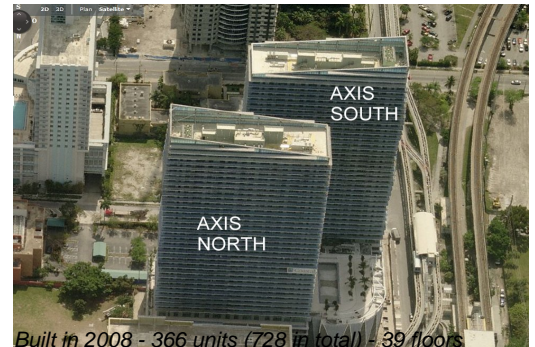
Built in 2008 - 366 units (728 in total) - 39 floors