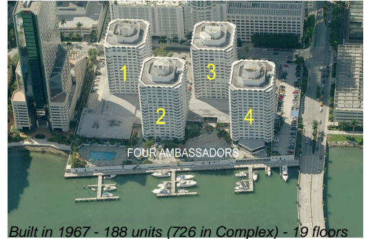
Built in 1967 - 188 units (726 in Complex) - 19 floors