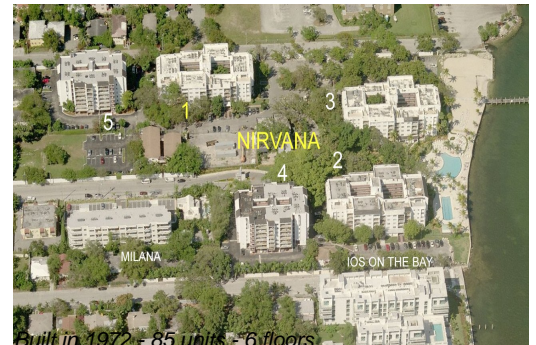
Built in 1972 - 85 units - 6 floors