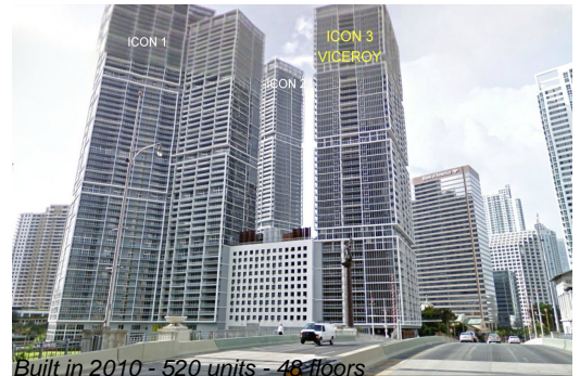
Built in 2010 - 520 units - 48 floors