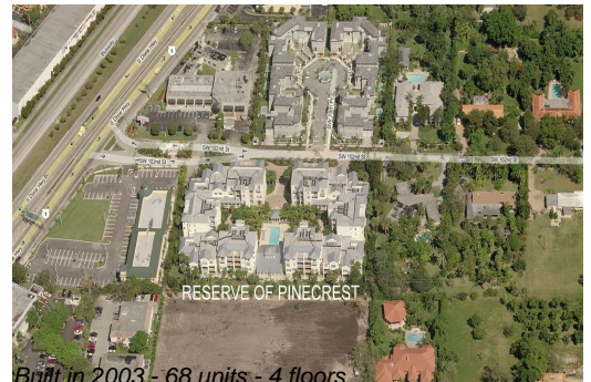
Built in 2003 - 68 units - 4 floors