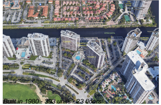
Built in 1980 - 393 units - 23 floors

The above valuated price is a baseline figure that does not take into account any specific renovation, upgrade, split, merge, or deterioration of the unit.