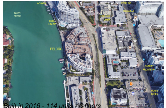
Built in 2016 - 114 units, 16 floors