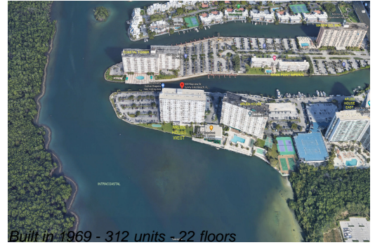
Built in 1969 - 312 units - 22 floors

The above valuated price is a baseline figure that does not take into account any specific renovation, upgrade, split, merge, or deterioration of the unit.