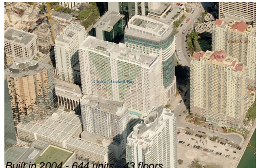
Built in 2004 - 644 units - 43 floors