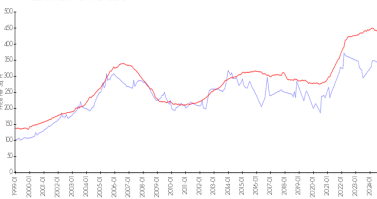
Landmark vs Aventura