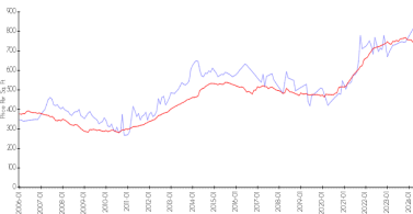
La Perla vs Sunny Isles