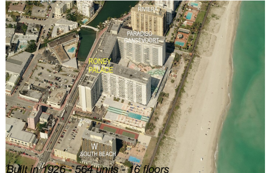
Built in: 1926 - 564 units - 16 floors