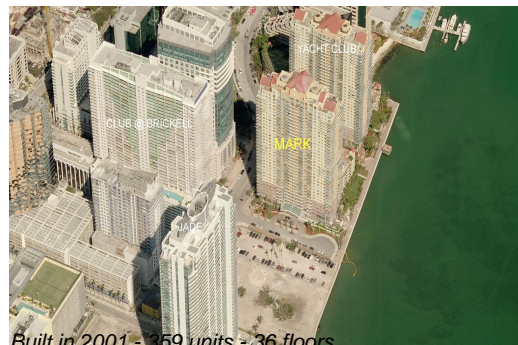
Built in 2001 - 359 units - 36 floors