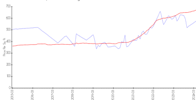
Nine at Mary Brickell Village vs Miami