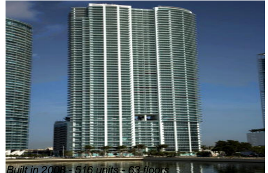
Built in 2008 - 516 units - 63 floors