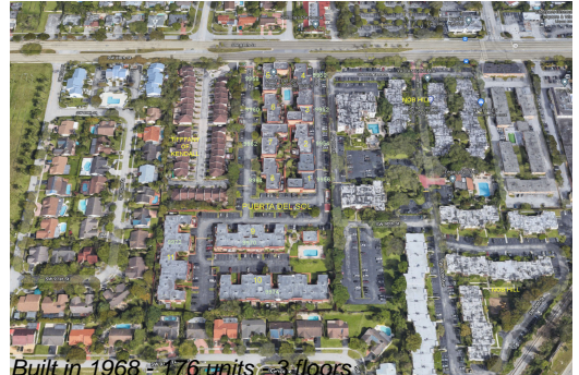
Built in 1968 - 176 units - 3 floors