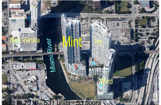
Built in 2010 - 531 units - 53 floors