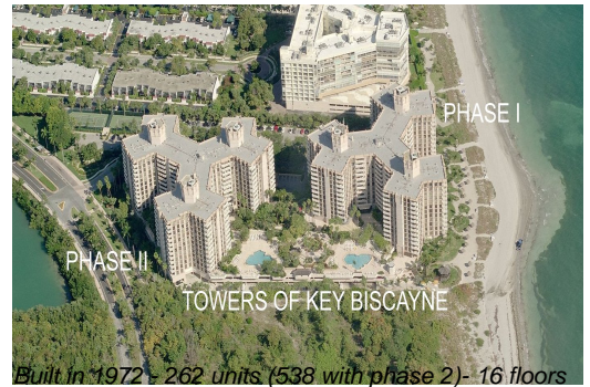
Built in 1972 - 262 units (538 with phase 2) - 16 floors