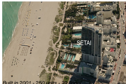
Built in 2001 - 250 units - 39 floors