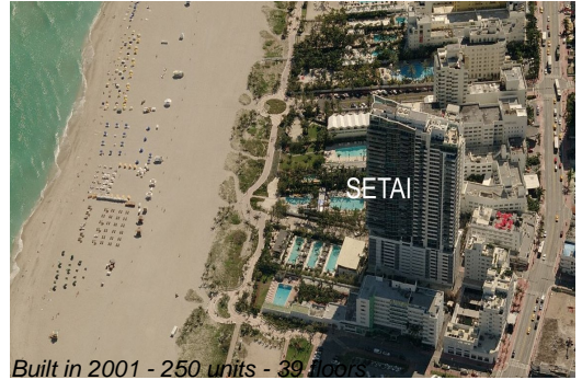
Built in 2001 - 250 units - 39 units for sale