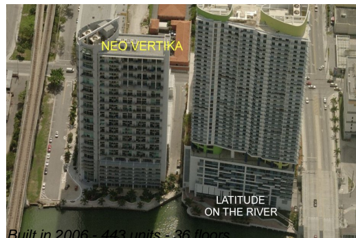
Built in 2006 - 443 units - 36 floors