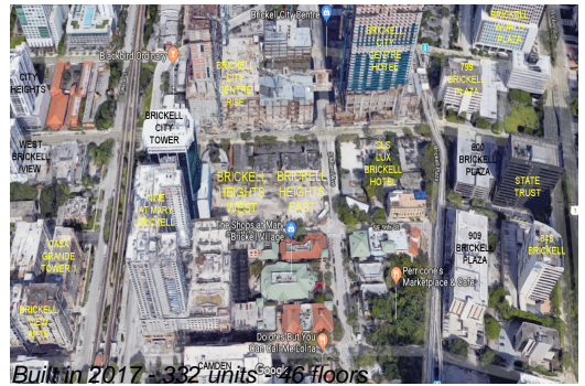
Built in 2017 - 332 units - 16 floors