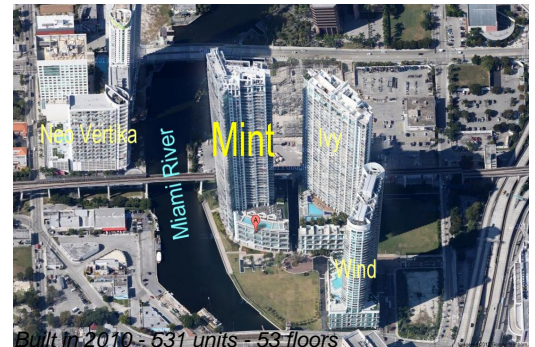
Built in 2010 - 531 units - 53 floors