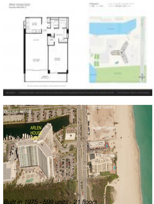
Built in 1975 - 599 units - 21 floors