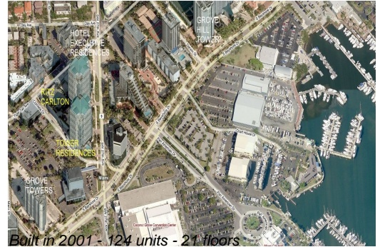
Built in 2001 - 124 units - 21 floors

The above valuated price is a baseline figure that does not take into account any specific renovation, upgrade, split, merge, or deterioration of the unit.