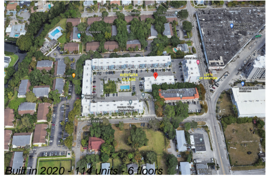
Built in 2020 - 114 units - 6 floors