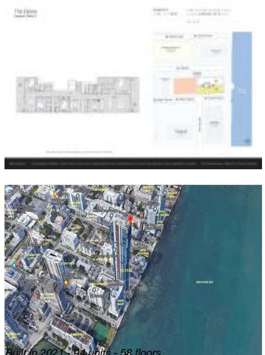
Built in 2021 - 94 units - 58 floors