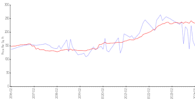
Cricket Club vs North Miami