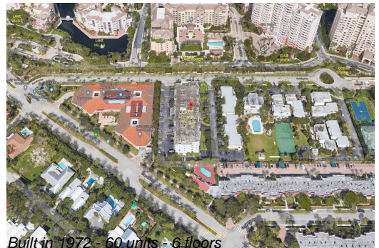
Built in 1972 - 60 units - 6 floors