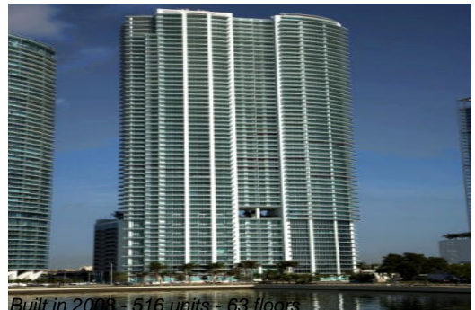
Built in 2008 - 516 units - 63 floors