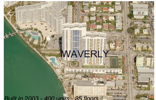
Built in 2003 - 400 units - 35 floors