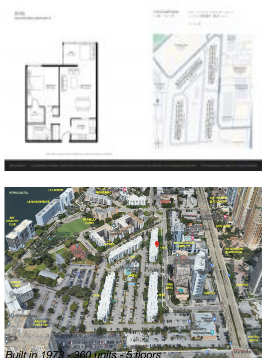
Built in 1973 - 360 units - 5 floors