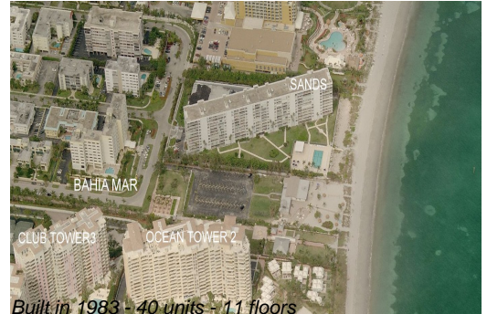
Built in 1983 - 40 units - 11 floors