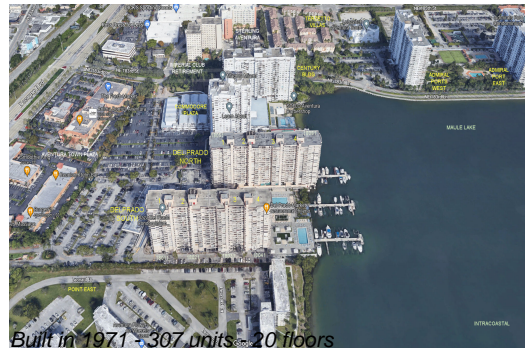
Built in 1971 - 307 units - 20 floors

18051 Biscayne Blvd # 1804 - 18051 Biscayne Blvd, Aventura, FL, Miami-Dade 33160