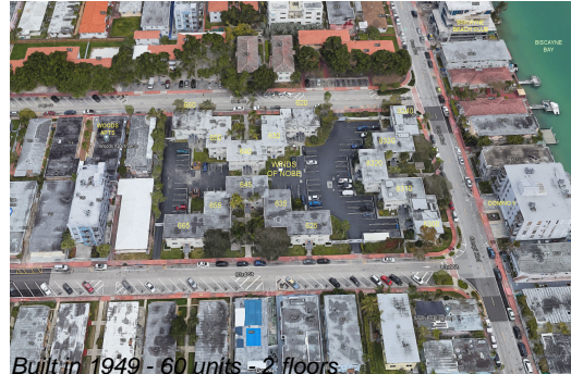
Built in 1949 - 60 units - 2 floors.