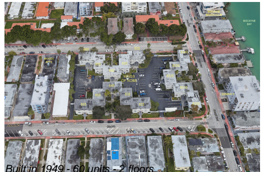
Built in 1949 - 60 units - 2 floors