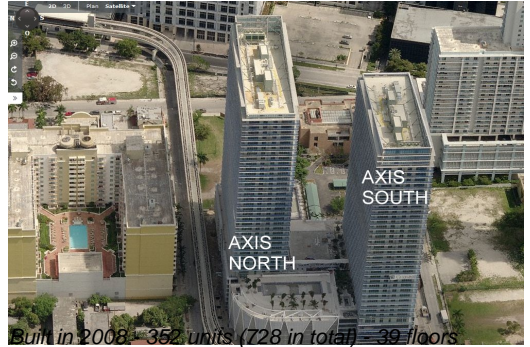
Built in 2008 - 352 units (728 in total) - 39 floors