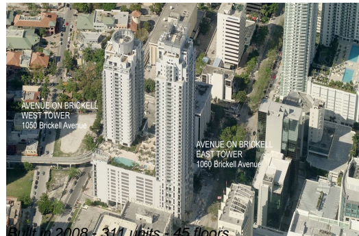
Built in 2008 - 311 units - 45 floors