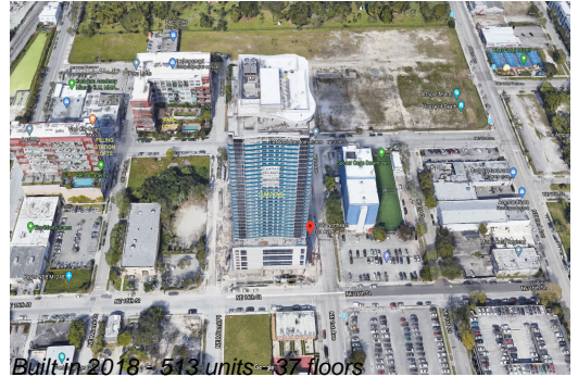
Built in 2018 - 513 units - 37 floors