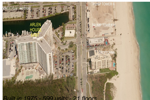
Built in 1975 - 599 units - 21 floors