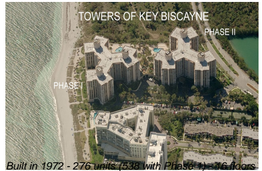
Built in 1972 - 276 units (536 with Phase I) - 16 floors