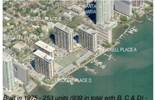
Built in 1975 - 253 units (939 in total with B, C & D) - 23 floors