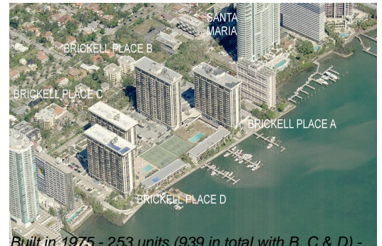
Built in 1975 - 253 units (939 in total with B, C & D) - 23 floors