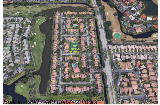
Built in 1990 - 440 units - 2 floors