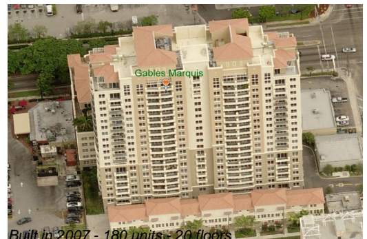
Built in 2007 - 180 units - 20 floors