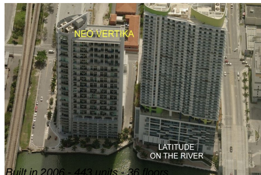
Built in 2006 - 443 units - 36 floors