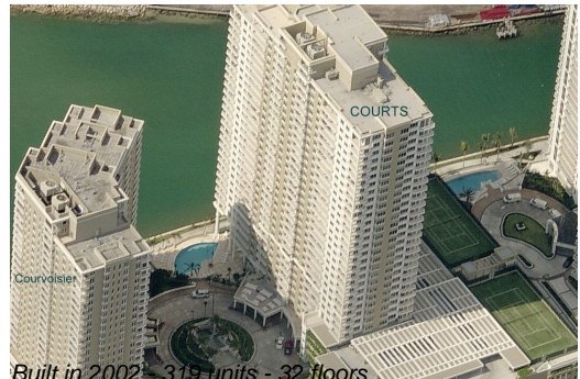
Built in 2002 - 319 units - 32 floors