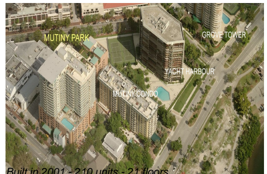
Built in 2001 - 210 units - 21 floors