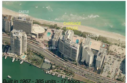
Built in 1967 - 385 units - 17 floors