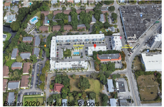
Built in 2020 - 114 units - 6 floors